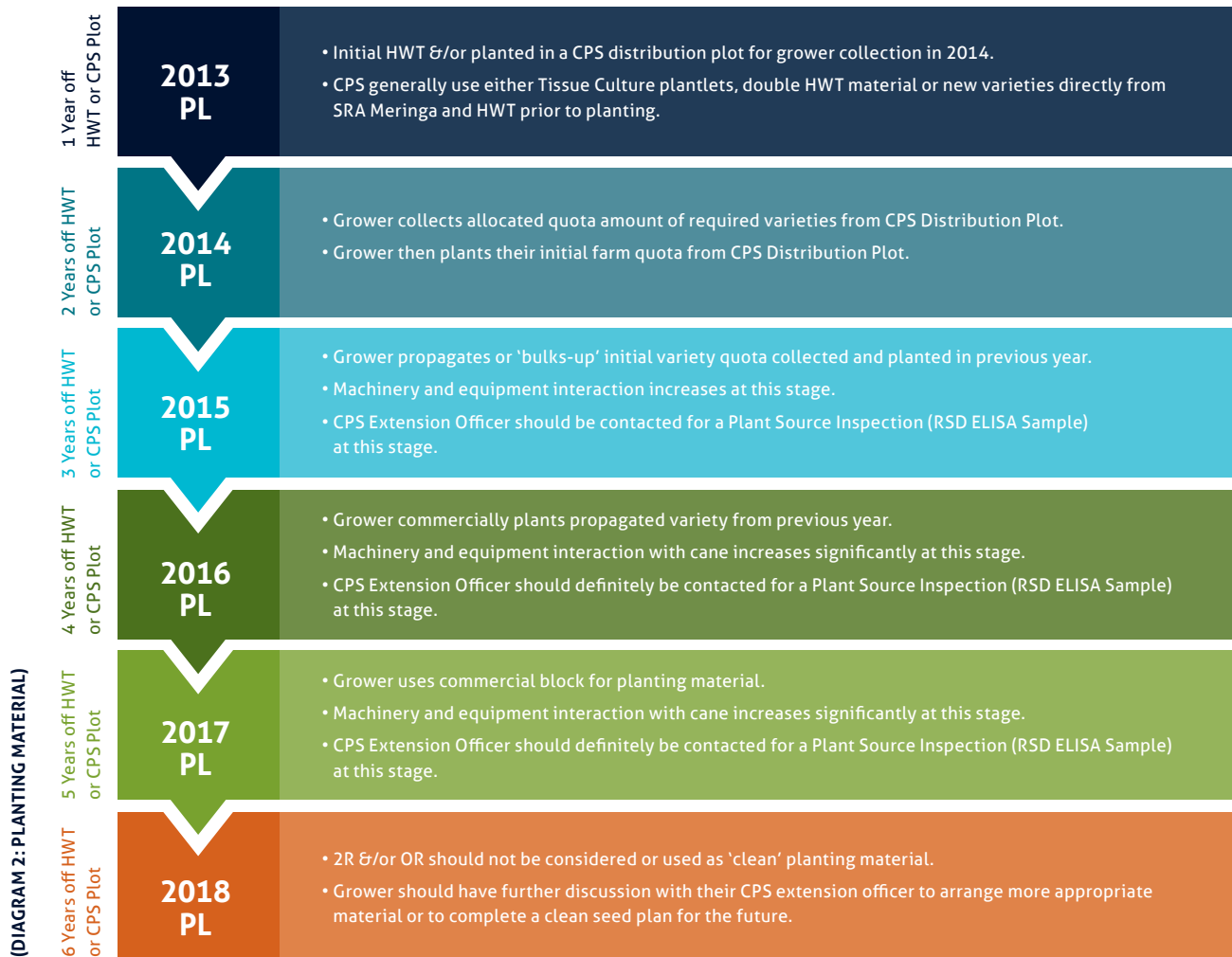
Diagram 2: An example for a Plant Material Source - tracking back how long that material has been away from either Hot Water Treatment, Tissue Culture or CPS Approved Clean Seed Plot. The timeline shows that just because it's plant cane, does not mean it is "clean cane".

When a grower is selecting material for planting, crop class and the time period from hot water treatment should always be considered. The example above is a best case scenario using material from a plant crop each year. You should be mindful that just because the material is from a plant crop, does not necessarily mean that it is clean. The time since hot water treatment should be considered whenever choosing your plant source. Using a timeline, like the example above, is an easy way to determine the history of your plant source material.